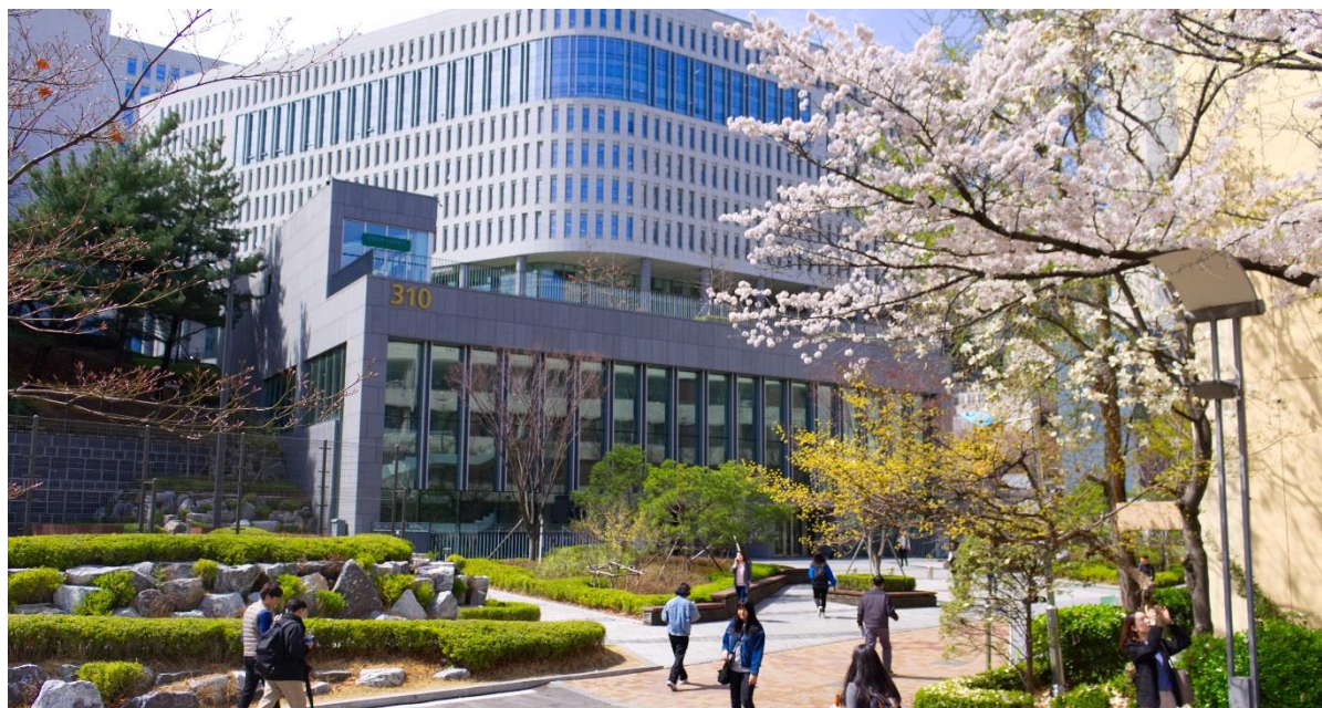
Centennial Building (Bldg. #310)